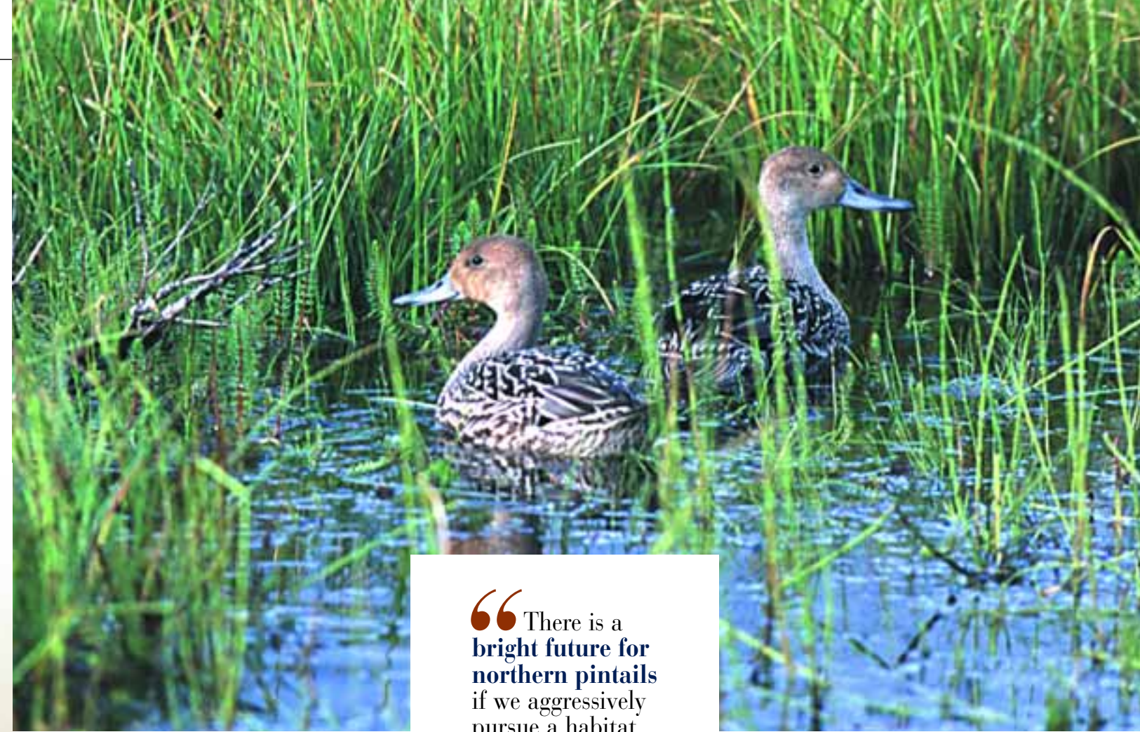
northern pintail hens: Brian Wollinski

“There is a bright future for northern pintails if we aggressively pursue a habitat conservation strategy that includes agricultural producers.”