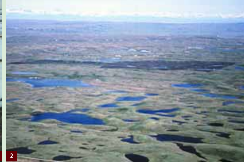
(1) DUC's Don Watson (right) discusses spring plans with McIntyre Ranch's general manager, Ralph Thrall III. The Milk River Ridge's pothole-pocked landscape (2) is home to a high density of northern pintails and other waterfowl. The region also hosts other unique prairie wildlife species such as mule deer (3), pronghorn antelope (4), coyote (5) and sharp-tailed grouse (6).

while promoting the sustainability of farming practices that have potential to improve the landowner's way of life. And that, according to Barrett, is a valuable asset when it comes to sitting down around the landowner's kitchen table and hammering out the details.