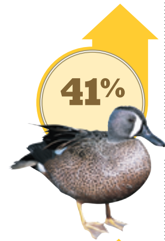
Right (top to bottom): blue-winged teal, redhead and northern pintail populations are at or near record highs this year.

All of the information is boiled down into a hefty report called Waterfowl Population Status 2011 . Of course there are variations in habitat conditions and waterfowl