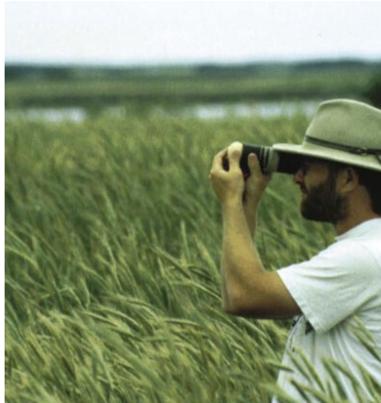
Researcher in winter wheat crop.

PHJV partners contributed to policy reform by engaging in planning committees, sharing research, preparing discussion papers, participating in public and private consultations on policy reforms, and initiating key program and policy reforms on the Canadian Prairies. Programs in which the PHJV participated include: