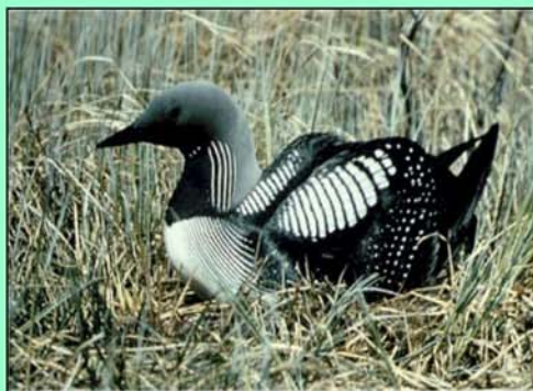
Pacific Loon

Pacific Loons breed throughout much of the boreal forest and tundra regions of North America. Although it is a species of interest, the status of the Pacific Loon population is unclear. Most population surveys have been conducted in Alaska, very few studies have investigated trends in Canada, where most of its breeding range lies.