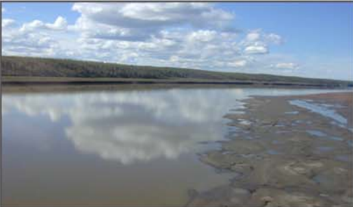
Mackenzie River