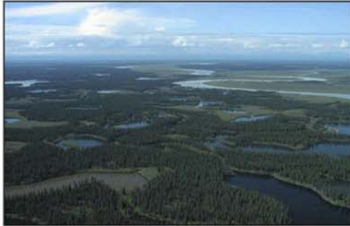
Mackenzie Delta

Ducks Unlimited Canada and its partners started this three year project to document waterbird use of the Lower Mackenzie Region. Vegetation classification and water chemistry data, combined with waterbird inventories, will be used to help us determine where important waterbird areas are within the study area. This poster concentrates on the results from the second year of waterbird surveys in the area.