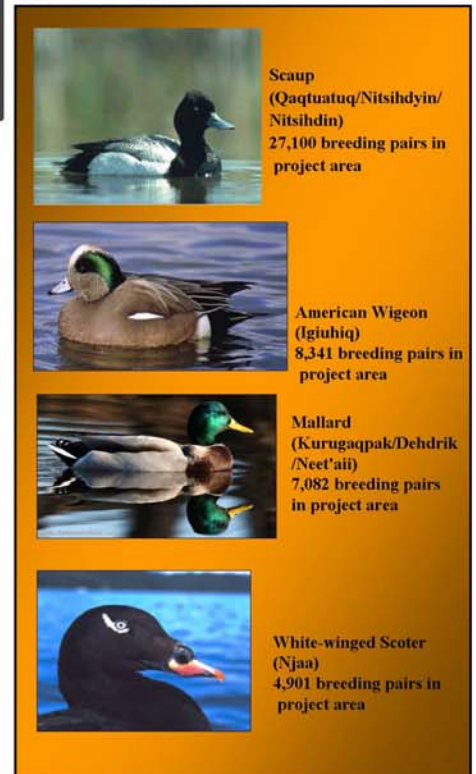
Top 4 breeding ducks in the project area (Wetland Basin Surveys Only)

Two fixed wing staging surveys were flown over the project portion of the delta (same dates as above). We estimated the total number of ducks on the delta during staging I and II surveys were 150,795 and 237,764 respectively (Figure 1).