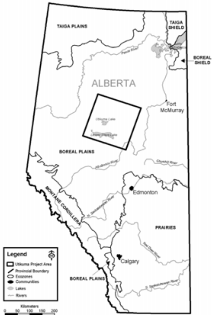
Figure 2. The Utikuma project area located in the boreal plains of north central Alberta.