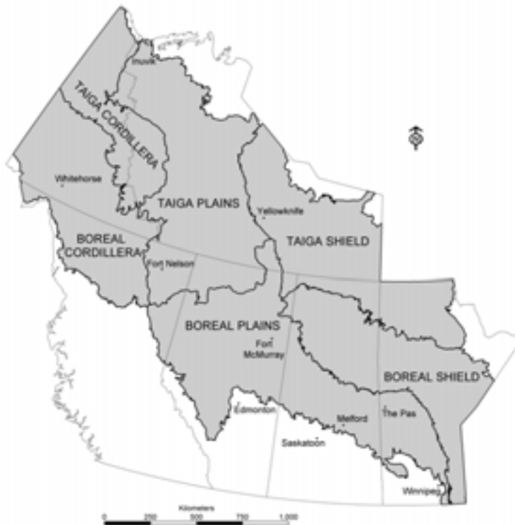
Figure 1. Ecozones of Canada's western boreal forest.

The Canadian Western Boreal Forest (WBF) expands over 3 million square kilometers and is contained within portions of five provinces and three territories (Figure 1). The WBF is comprised of eight ecozones and supports a population of 12-14 million breeding ducks (Ducks Unlimited 2001). This area has been designated as a level one priority with respect to the most important waterfowl habitat areas at risk in North America (Ducks Unlimited 2001). Populations of several common boreal nesting waterfowl species such as lesser scaup and scoters are declining (Wilkins and Otto 2002). As a result, these species have been the focus of considerable discussion (Austin et al. 2000) and are currently the emphasis of many research initiatives including that conducted by Ducks Unlimited Canada (Slattery 2002). Industrial activity including petroleum exploration and development, forestry, mining and hydro electricity generation as well as agriculture has greatly expanded in the Western Boreal Forest. The influence of these activities on boreal wetland ecosystems and water birds remains largely unknown.