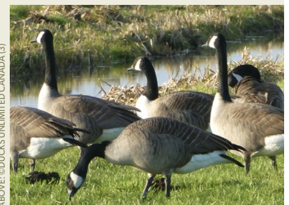
Fewer wildlife conflicts