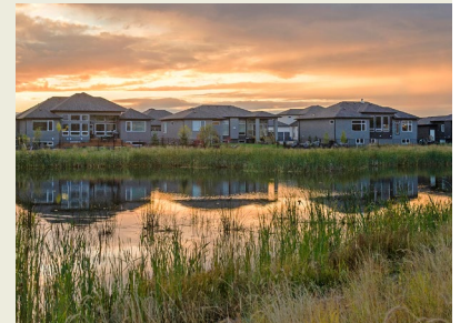
Improved water quality