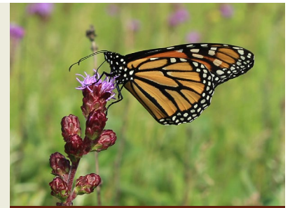
Valued green space

We offer stormwater-management solutions for residential or commercial building sites. Our services begin with an expert site analysis and comprehensive project blueprint that supports surface-water and stormwater management for the surrounding community. We design and build using verified best-management practices, working seamlessly with engineers and consultants, resulting in products that are fully in compliance with municipal and provincial policies and regulations in Ontario.