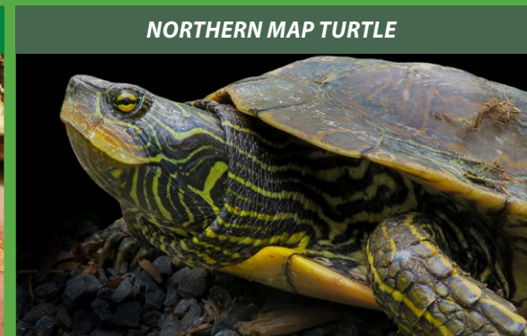
NORTHERN MAP TURTLE