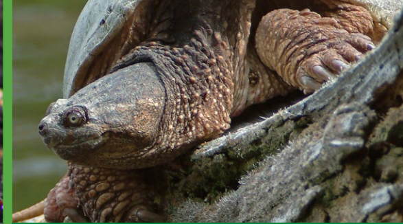
COMMON SNAPPING TURTLE